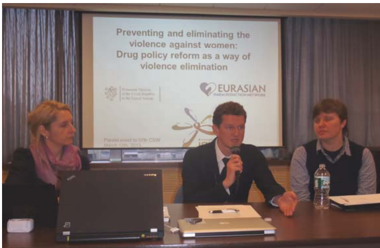
IGPN-EHRN paralel event of Comission on the Status of Women