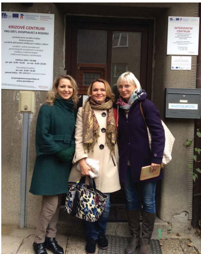
Study visit of Ukrainian experts on domestic violence to Brno, Czech Republic