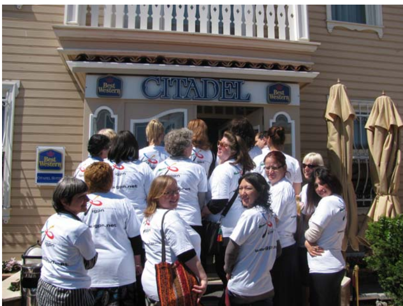
Leaders of IGPN member organizations in Istanbul, during AWID Forum 2012